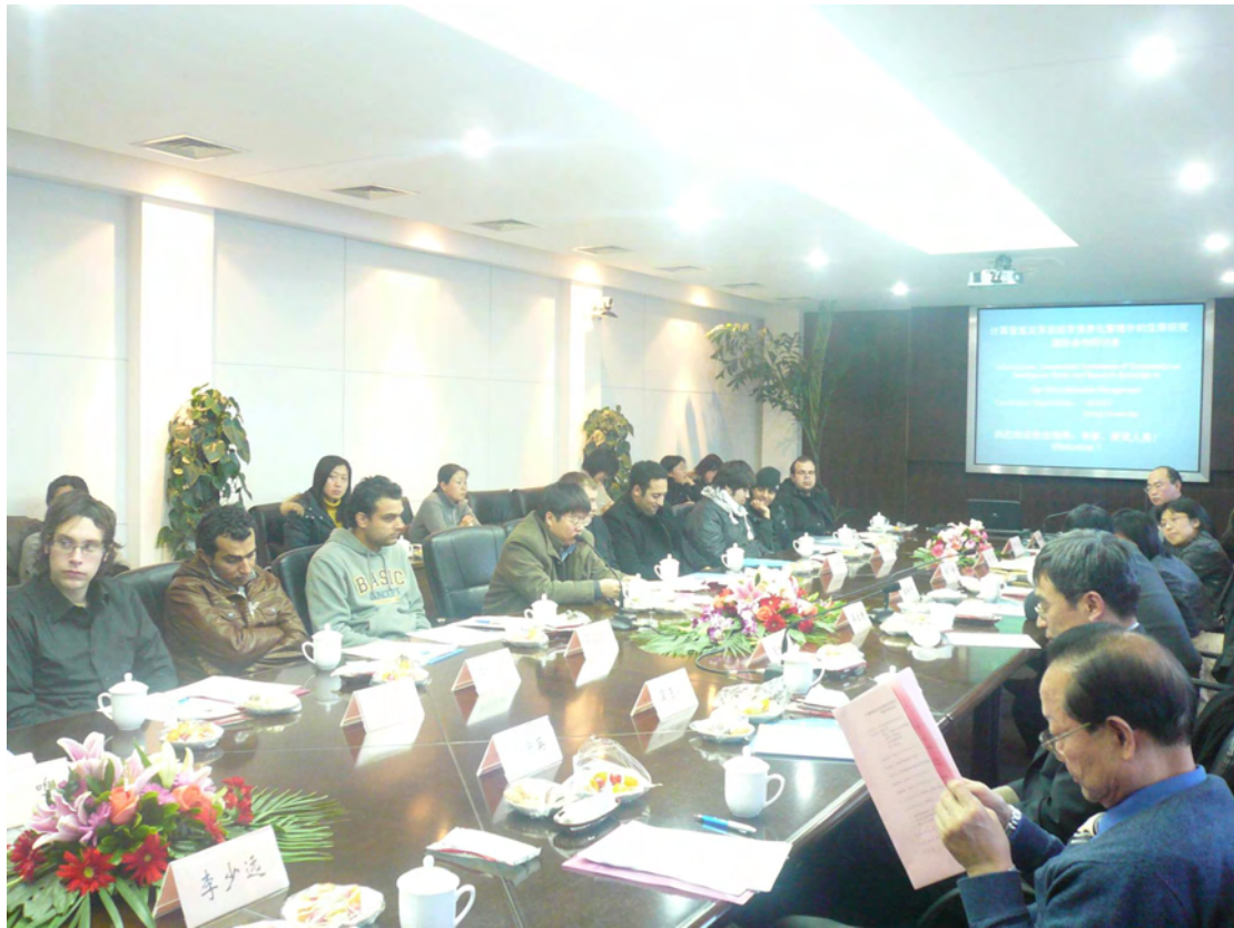
(1) Viewpoint Presentation was given by Professor Wu Qidi, Former Vice Minister of Education ,members of the NPC Standing Committee